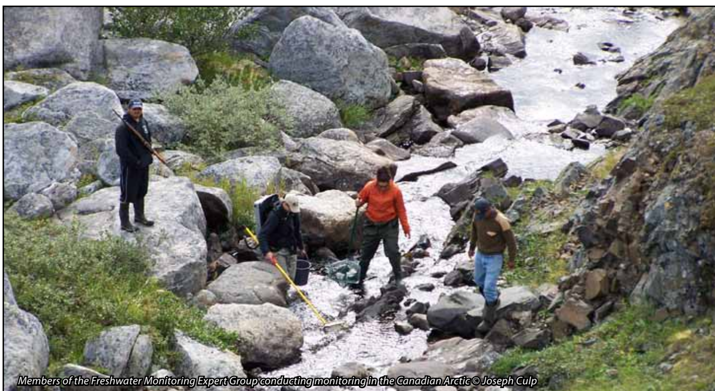
Members of the Freshwater Monitoring Expert Group conducting monitoring in the Canadian Arctic

Note: This report is a summary of key activities and developments since the May 2011 Ministerial, and does not represent a comprehensive list of CAFF activities, priorities and projects. Timelines and dates are subject to change.