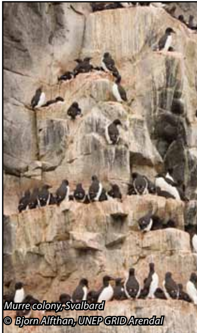
Murre colony, Svalbard

CAFF may establish expert groups with specific mandates related to key activities for CAFF, and which ensure that scientists, conservationists, and managers interested in arctic flora and vegetation have a forum to promote, facilitate, and coordinate conservation, management, and research activities of mutual concern. These groups have been invaluable in synthesising, coordinating and publishing research.