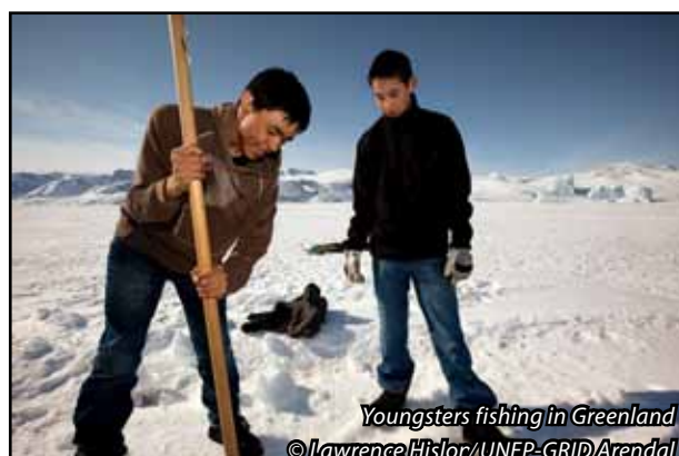
Youngsters fishing in Greenland