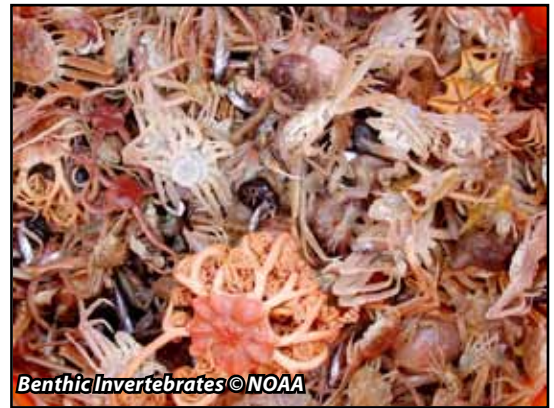
Benthic Invertebrates

The Circumpolar Biodiversity Monitoring Program (CBMP) is an international network of scientists, government agencies, Indigenous organizations and conservation groups working together to harmonize and integrate efforts to monitor the Arctic's living resources. The CBMP is currently working with over 60 partner organizations across the Arctic.