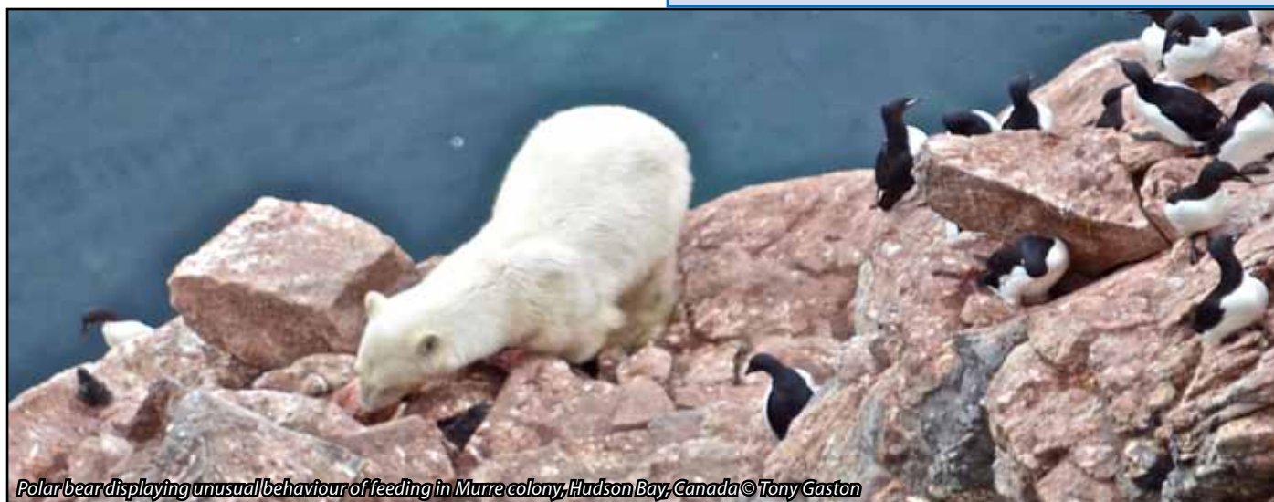
Polar bear displaying unusual behaviour of feeding in Murre colony, Hudson Bay, Canada

For more information: www.caff.is/assessments