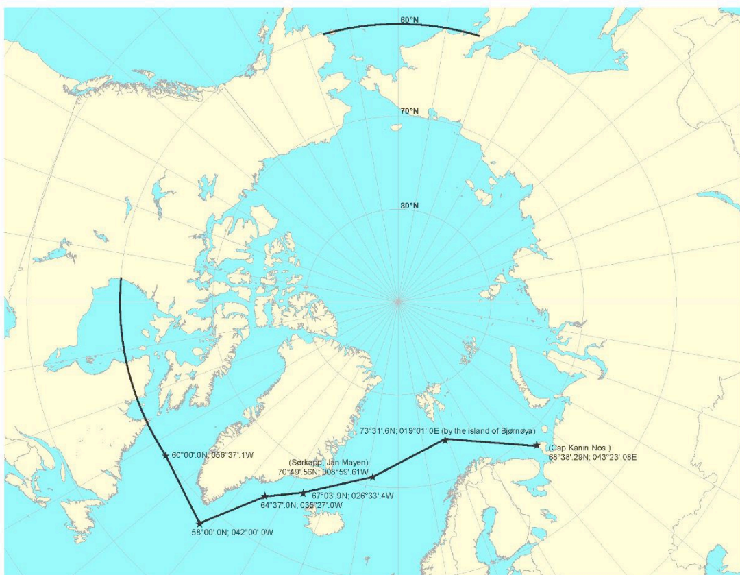
Fig. 1 Resolution MEPC.265(68) 15 May 2015.

“For the purposes of the Polar Code, Arctic waters means those waters which are located north of a line from the latitude 58°00′.0 N and longitude 042°00′.0 W to latitude 64°37′.0 N, longitude 035°27′.0 W and thence by a rhumb line to latitude 67°03′.9 N, longitude 026°33′.4 W and thence by a rhumb line to the latitude 70°49′.56 N and longitude 008°59′.61 W (Sørkapp, Jan Mayen) and by the southern shore of Jan Mayen to 73°31′.6 N and 019°01′.0 E by the Island of Bjørnøya, and thence by a great circle line to the latitude 68°38′.29 N and longitude 043°23′.08 E (Cap Kanin Nos) and hence by the northern shore of the Asian Continent eastward to the Bering Strait and thence from the Bering Strait westward to latitude 60° N as far as Il'pyrskiy and following the 60th North parallel eastward as far as and including Etolin Strait and thence by the northern shore of the North American continent as far south as latitude 60° N and thence eastward along parallel of latitude 60° N, to longitude 056°37′.1 W and thence to the latitude 58°00′.0 N, longitude 042°00′.0 W.”