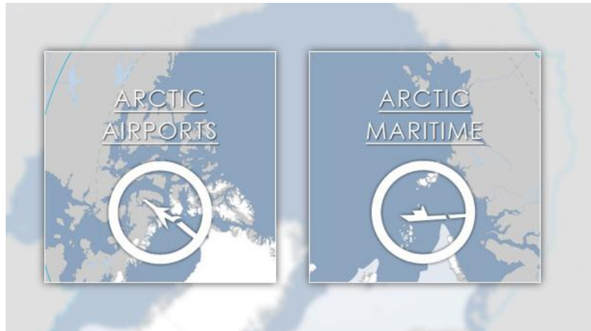
Opening screen for the AMATII Database

After choosing either ARCTIC AIRPORTS or ARCTIC MARITIME , the user will see a list of airports and/or ports/harbors. The list within each sector can be re-configured alphabetically to highlight a number of features, such as name of the facility, region, and country.