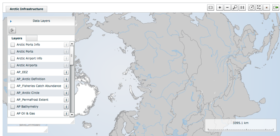
Opening screen for the Interactive Map

The primary deliverable of the project, the INTERACTIVE MAP , takes the user directly to: