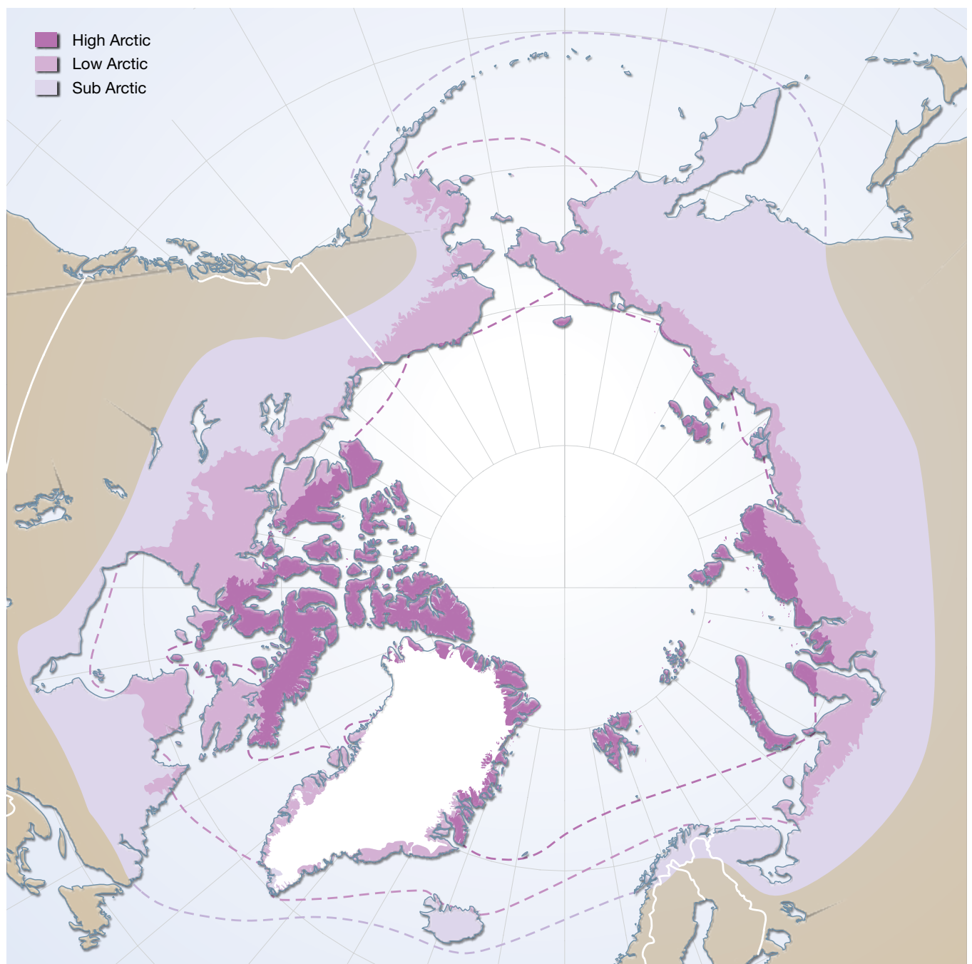
Boundaries of the geographic area covered by the Arctic Biodiversity Assessment.