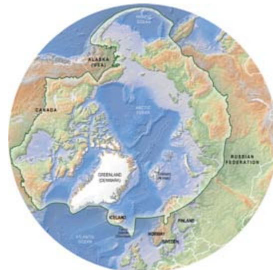
— CAFF Designated Area

CAFF International Secretariat Borgir, Nordurland 600 Akureyri, Iceland Phone: +354 462-3350 Fax: +354 462-3390 Email: caff@caff.is Internet: http://www.caff.is