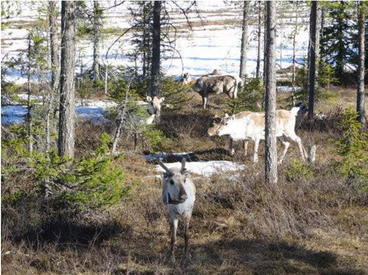
New tools and approaches, such as “Reindeer EIA guide” are needed to manage sustainability pressures in a changing environment.

The panel discussion focused on suggestions for the best measures to improve resilience in the Arctic, as well as lessons learnt to improve the sustainability and resilience in the Arctic. In the arctic circumstances the distances are longer, there are less people and they are more dependent on the communities, which are thus stronger. In the changing climate the vulnerability of e.g. tourism is rising, and this is one of the local concerns dealt with.