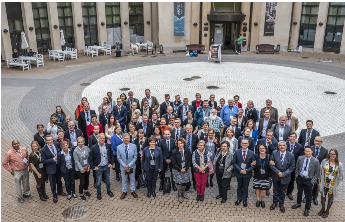
Participants at the first Arctic Resilience Forum, Rovaniemi 2018 (Photo: Otto Pontto).

The level of awareness as well as overall readiness for addressing climate and other environmental changes and their linkages to human development has markedly increased in recent years. This has been demonstrated, among other events, by the adoption of the Sendai Framework for Disaster Risk Reduction in March 2015, the adoption of the 2030 Agenda and its Sustainable Development Goals (SDGs) in September 2015, and the Paris climate agreement of December 2015. Each of these speaks to the importance of strengthening the resilience of vulnerable communities and ecosystems. Building on these global agreements, numerous regional bodies, as well as national bodies around the world are adopting frameworks and strategies to adapt to climate change and build resilience. Simultaneously, while numerous local communities are struggling to cope with the very tangible impacts of a changing climate, efforts to more proactively build resilience are taking shape.