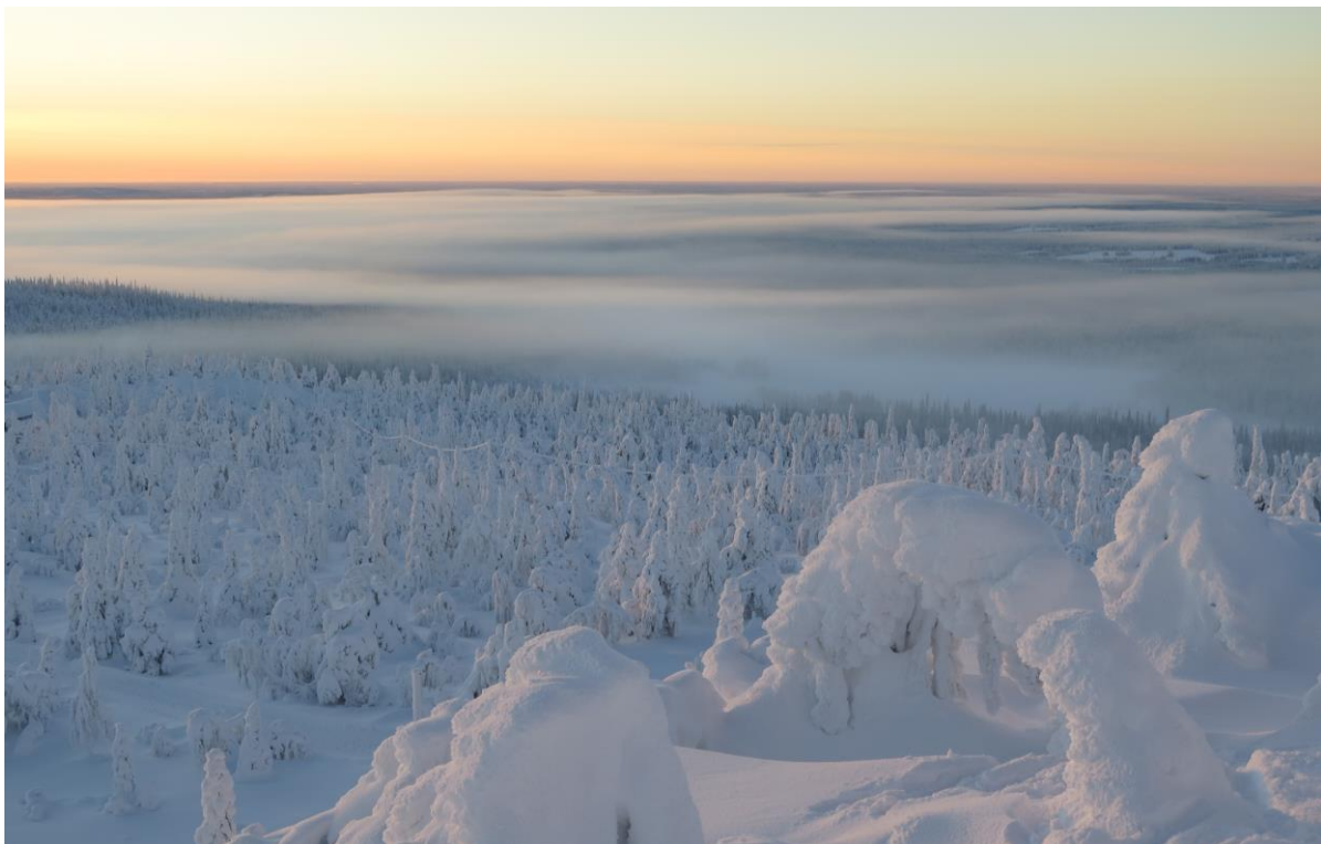
While the interest in Arctic regions as travel destination is growing, climate change amplifies the pressures on sustainability.

Rauno Posio, project leader of Visit Arctic Europe , a joint marketing and development project for Northern Scandinavian region travel companies, talked about how the tourism sector in Arctic Europe is adapting. The interest in Lapland as a travel destiny with its pure air and nature is growing, at the same time as the snowy season is dramatically shortening.