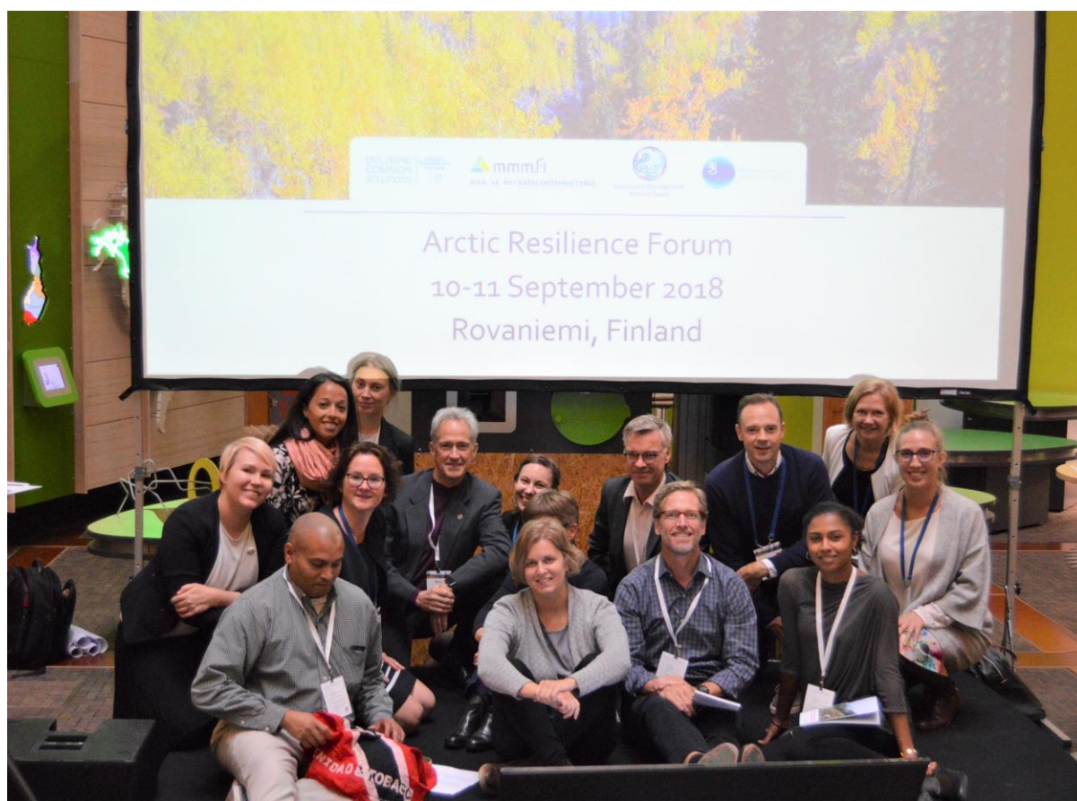
The team that had the pleasure to prepare and facilitate the 1 st Arctic Resilience Forum

transformation of livelihoods remains the sole option. The Forum also highlighted critical aspects of human well-being and health as well as the importance of improving awareness and capacity, through examples related to health impacts caused by climate change and the need to transform education.