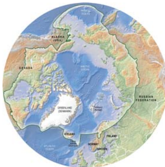
— CAFF Designated Area