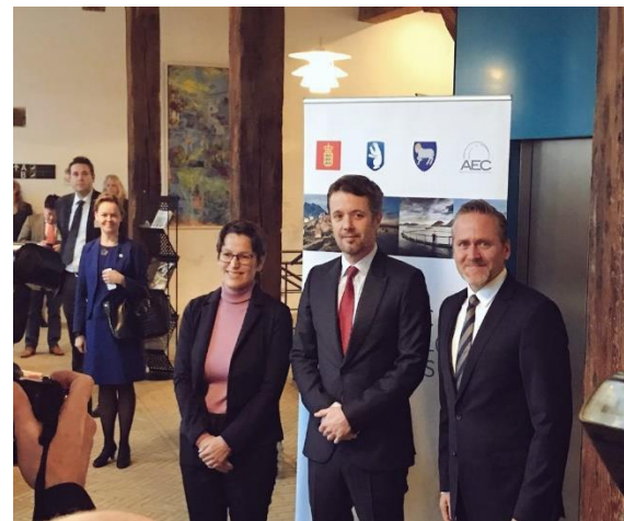
His Royal Highness the Crown Prince of Denmark, Ms. Suka K. Frederiksen, Minister of Independence, Foreign Affairs and Agriculture, Greenland, and Mr. Anders Samuelsen, Minister for Foreign Affairs of the Kingdom of Denmark, before the Conference.

The Conference addressed in particular the economic dimension with a strong focus on the role of the private sector and private-public partnerships, the role of the Arctic Council and the Arctic Economic Council, the need for more investments in the Arctic, inclusion of indigenous peoples, and continued local and international cooperation in the region.