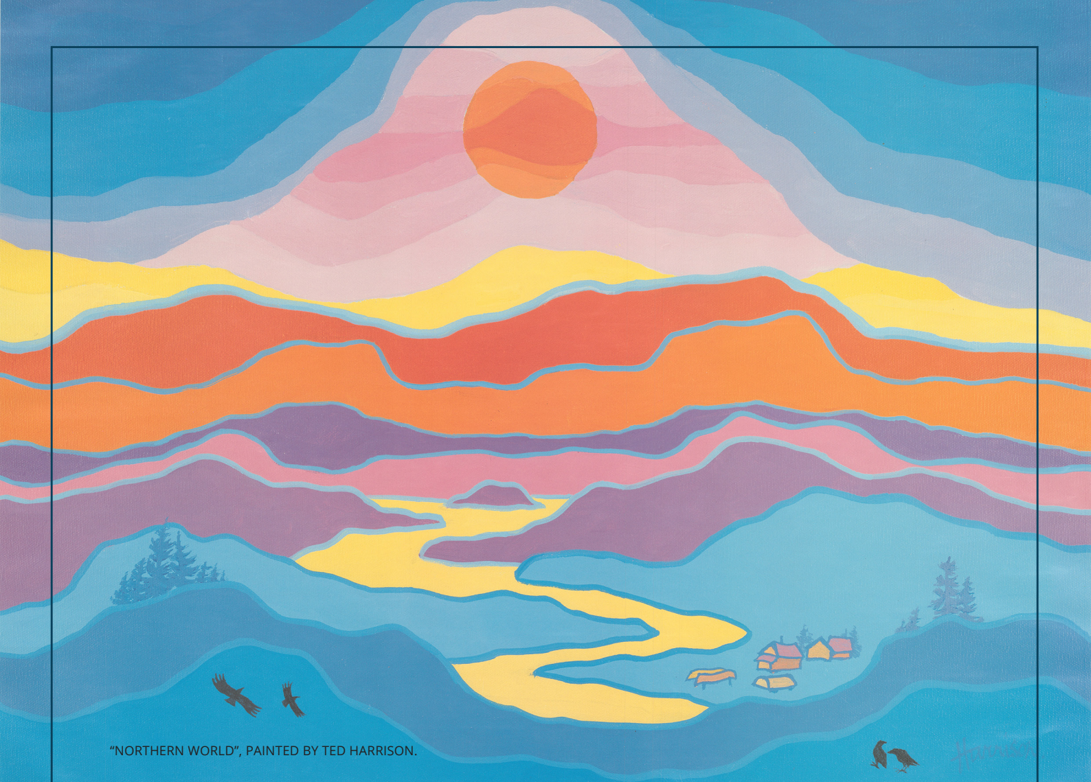
"NORTHERN WORLD", PAINTED BY TED HARRISON.