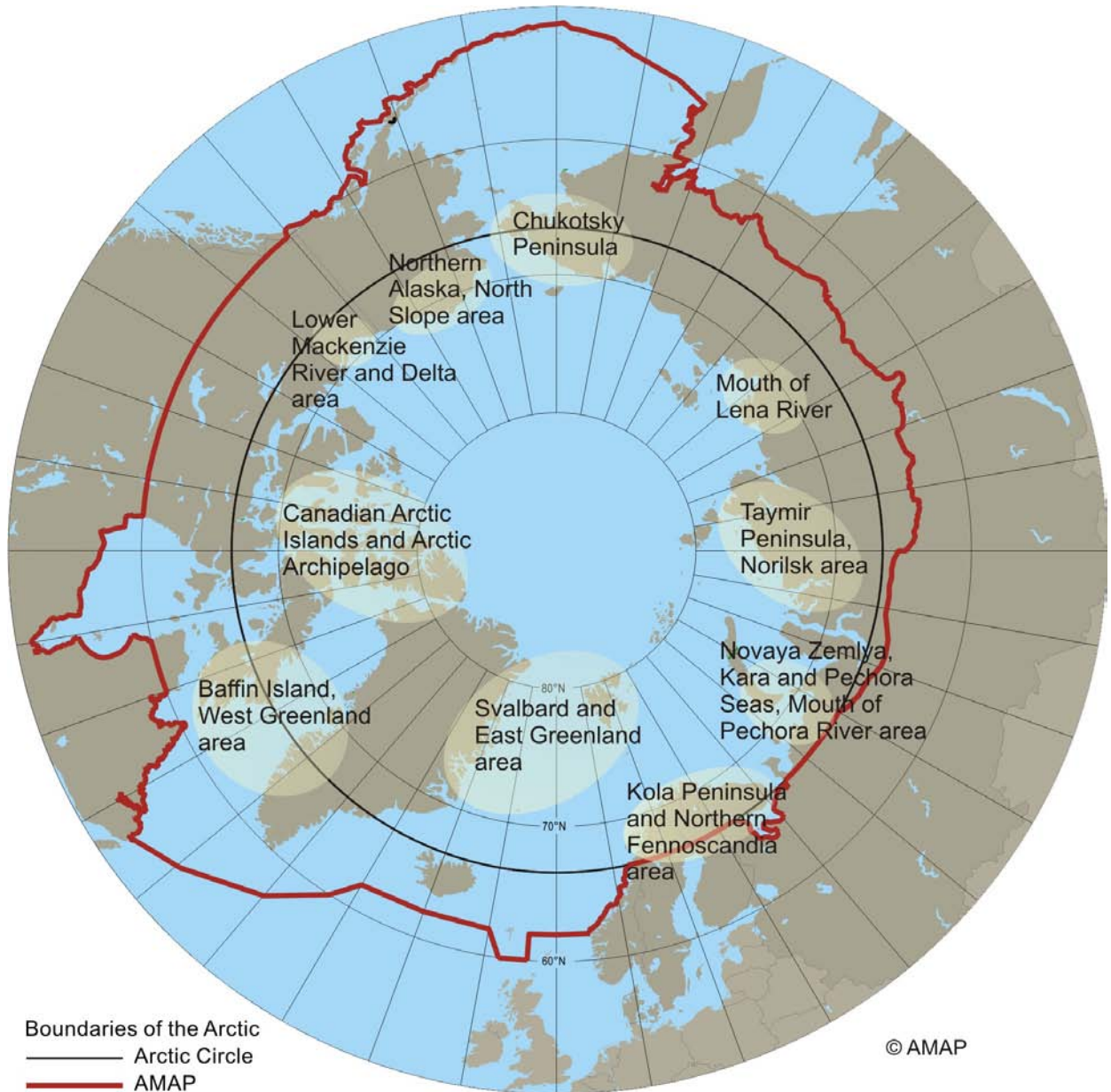
Figure 1. Geographic scope of AMAP with designated key areas.

implement special projects to address issues of concern, to involve them in AMAP monitoring efforts, and to support community-based monitoring programs.